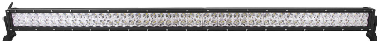
50" 96 LED 25,920 lm