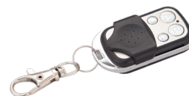
RC10 REMOTE INCLUDED