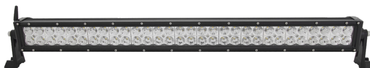
33" 60 LED 16,200 lm